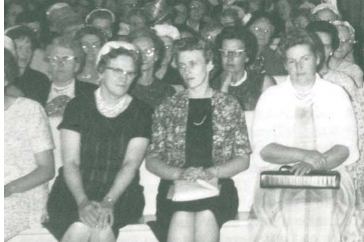
Women at first AFLC conference June 1963