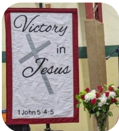
WMF Day Theme Banner