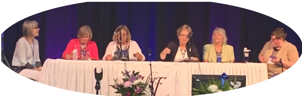
2022 Officers conducting the annual business meeting.