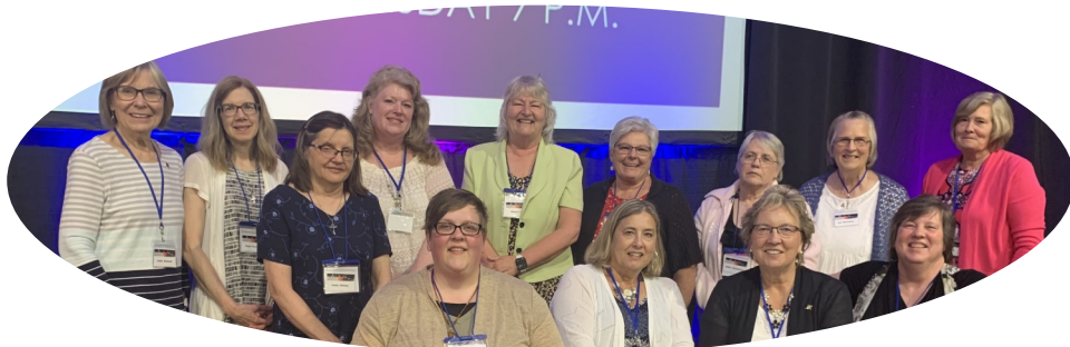
Advisory Committee meeting following WMF Day.