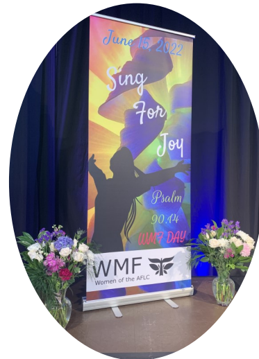
The WMF Day Banner with the Memorial Flowers