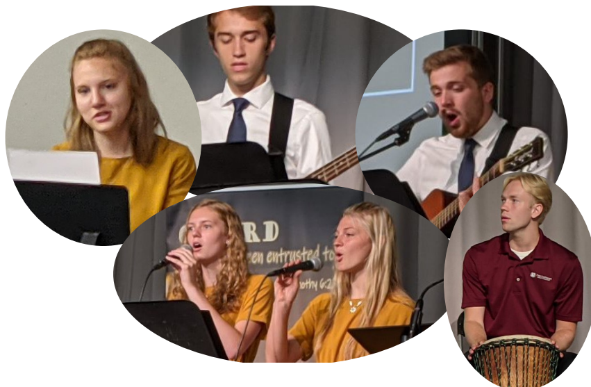
Morning Praise and Worship was led by the 2021 Ambassador Team