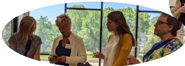
Coffee time and fellowship