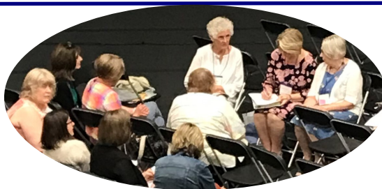
One of several discussions groups during WMF Day 2021