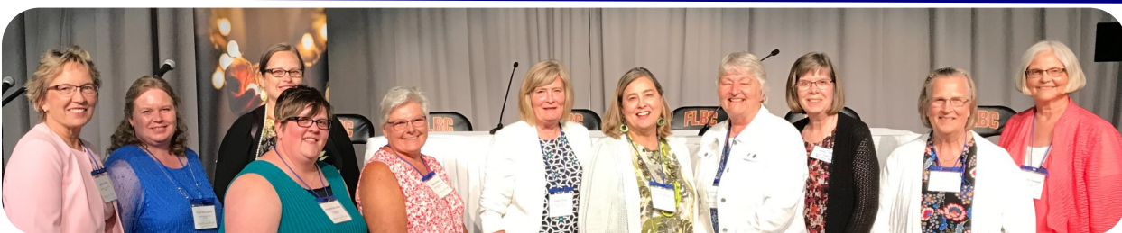
The Advisory committee met after the meeting .

I'm so thankful we followed Him even though it was difficult. As we step out in faith again and take our first call to Salinas CA- far from home, we are anticipating God's goodness! We know He who called us is faithful!