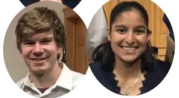
VBS Team shared some of their songs.