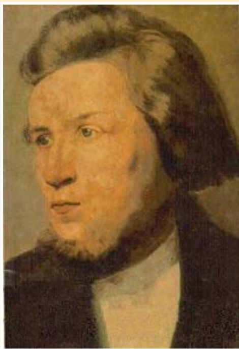
Hans Nielsen Hauge (1771-1824)