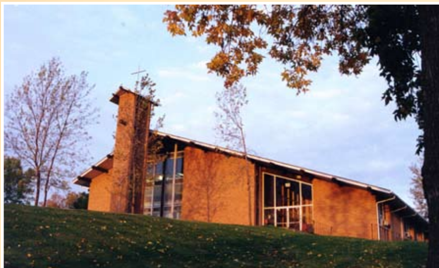
Free Lutheran Schools Chapel, Plymouth, MN