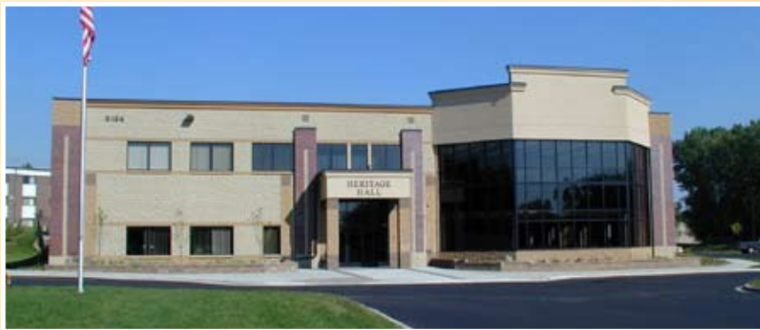
Heritage Hall, Plymouth, MN