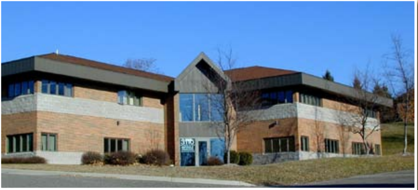
AFLC Administration Building, Plymouth, MN