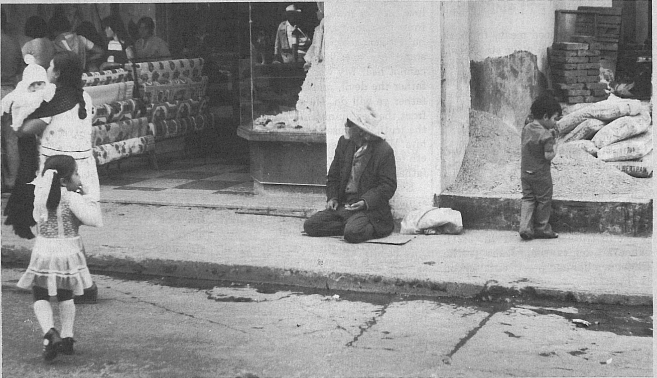
MEXICO

"World evangelism demands haste because the destiny of immortal human beings is at stake."