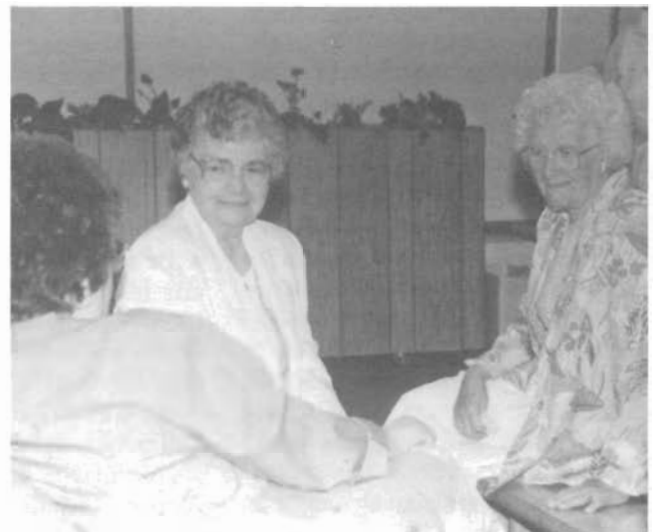
Fellowship times are always special at conference.