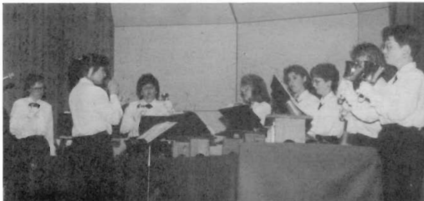
The Bethel Bell Choir, Grafton, North Dakota, performed Thursday evening. There were 295 women registered, making it one of the largest conventions.