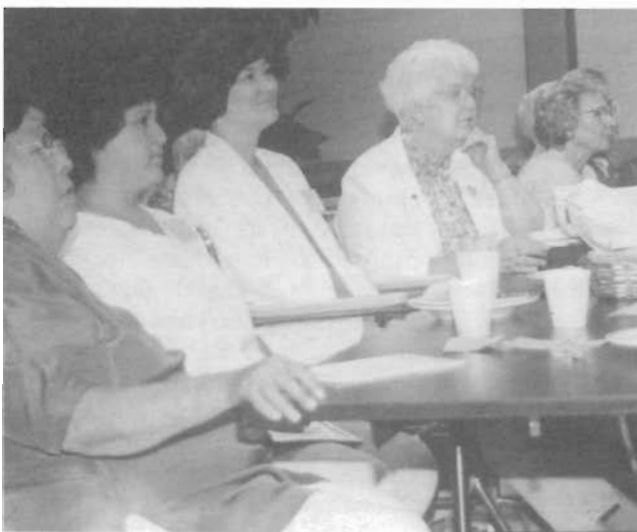
The Thursday WMF Breakfast.