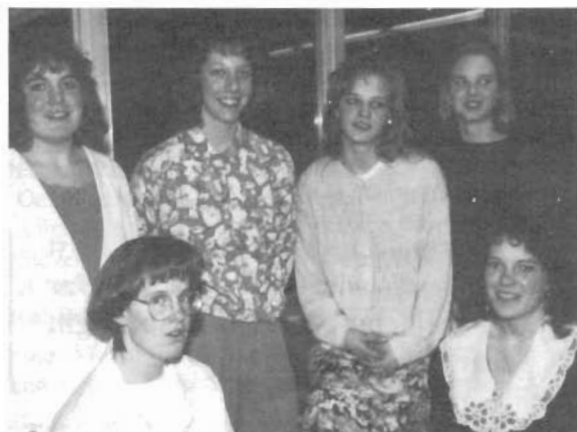
Six of the twelve FLY Team members.