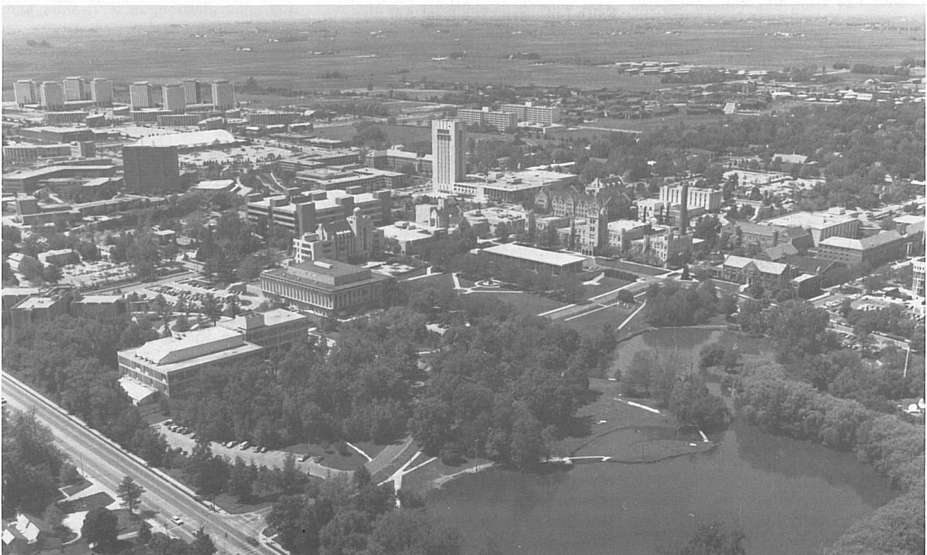
Aerial view of the campus of Northern Illinois University in DeKalb. Note Holmes Student Center in upper center of photo.