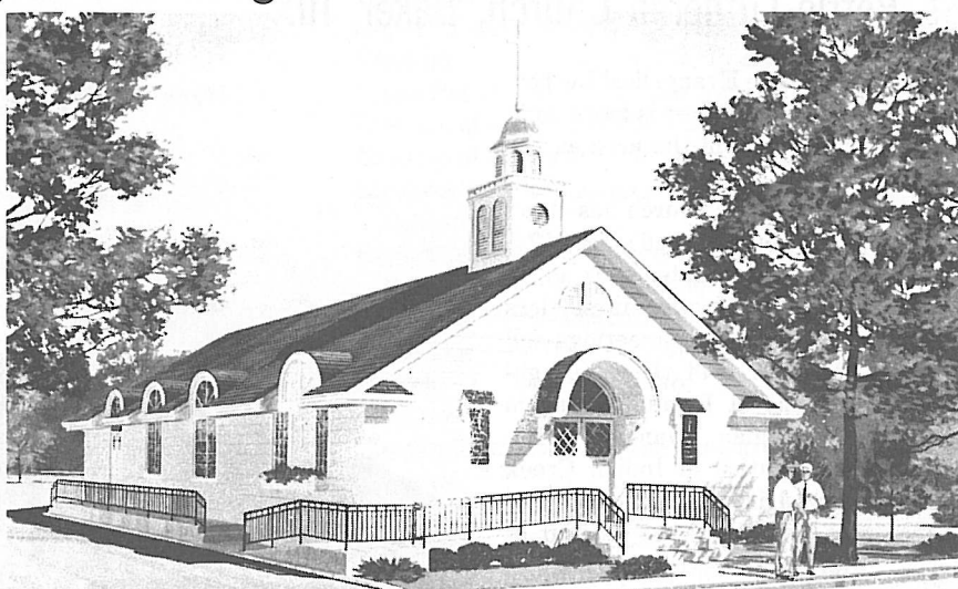
Proposed Massapequa church.