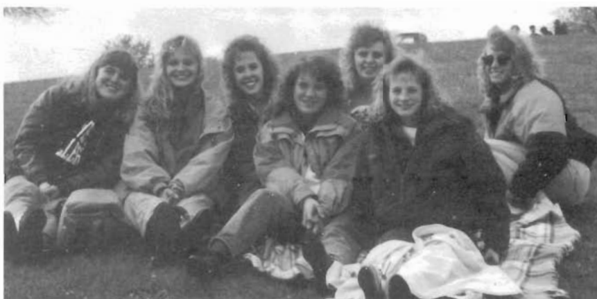
1990 and '92 AFLBS graduates settled down to enjoy the annual football game.