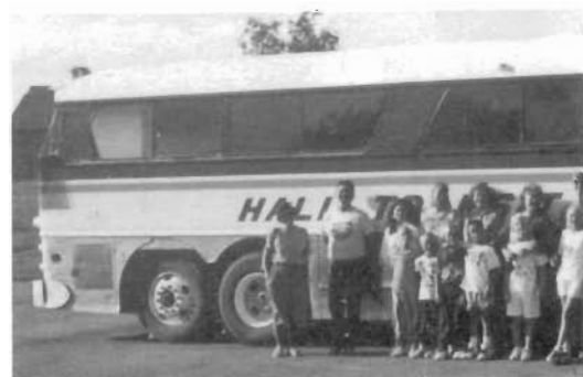
Partners in Mission

Another addition to our AFLC missionary address book is the expanded zip code for Campo Mourao, Brazil. It should now be 87300-970.