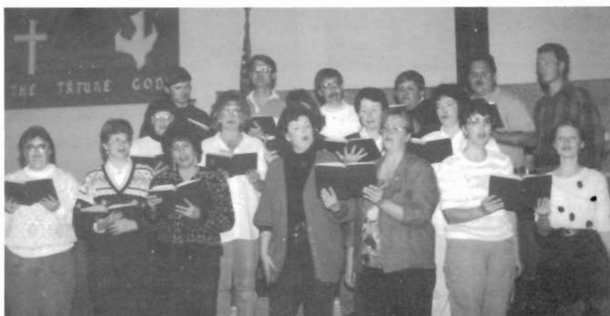
Alumni from the classes of '79 and '78 sang during the Saturday evening program.