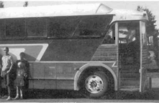
mission Outreach bus.

"Be anxious for nothing, but in everything by prayer and supplication with thanksgiving let your requests be made known to God" (Philippians 4:6).