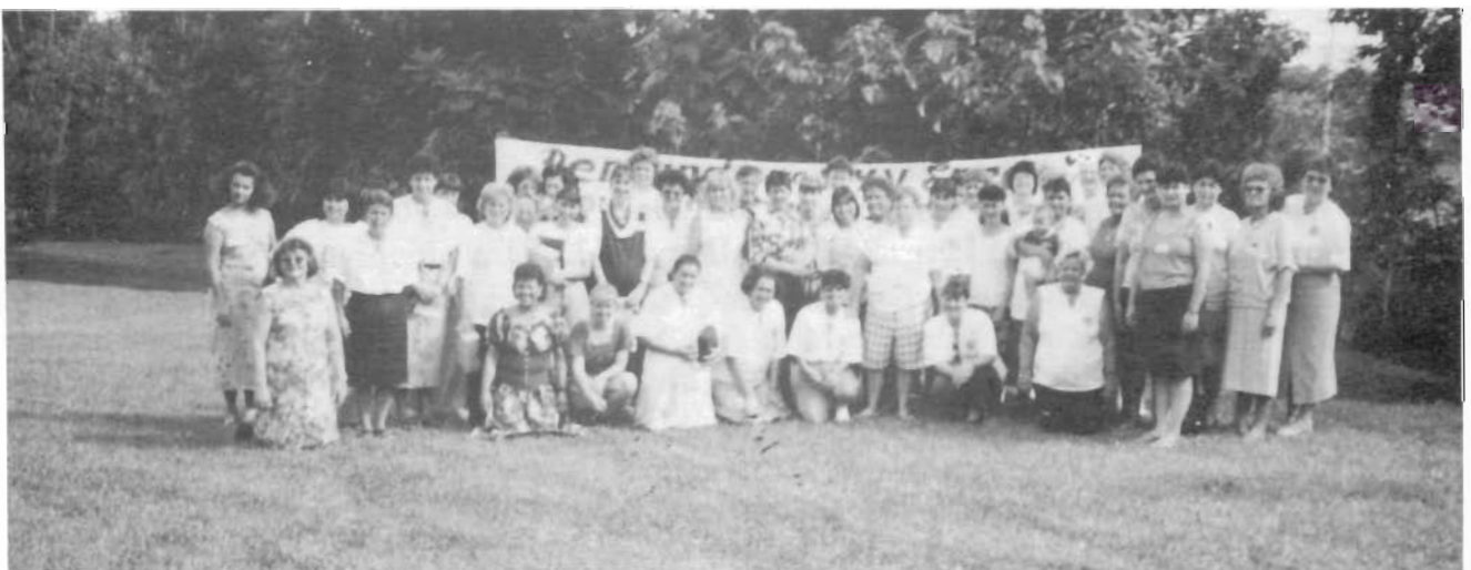
The ladies attending the 25th Anniversary in Brazil.