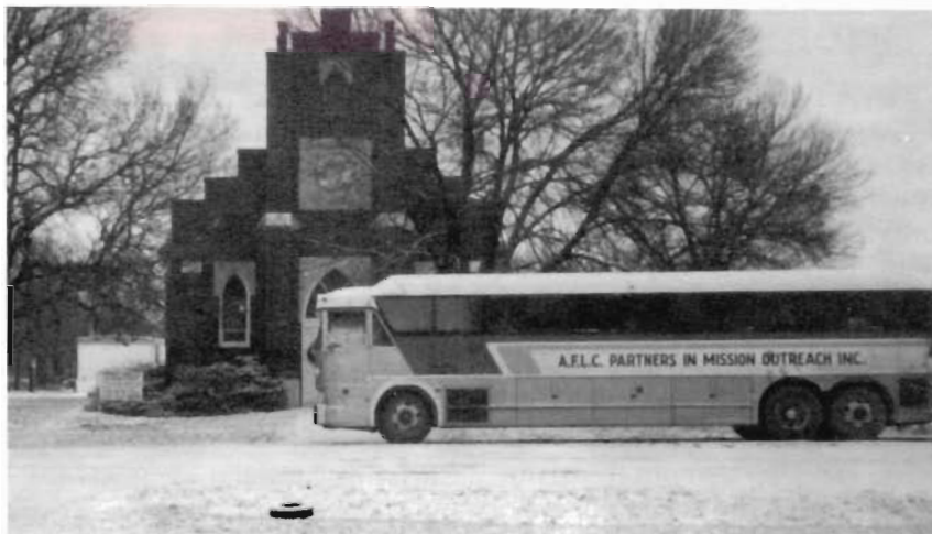
Mission bus in front of St. Peder's Lutheran Church.

There is one special congregation in the middle of Nebraska that has blessed us. St. Peder's Lutheran in Dannebrog requires elaborate directions for a new-comer to locate, but it indeed is