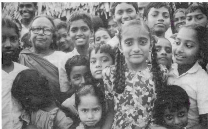
One of the many crowds of villagers who gathered close to see the strangers from America.