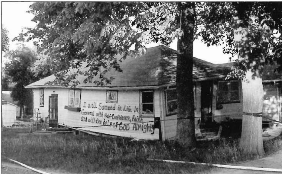
A 1997 flood damaged home near the Red River.

Where do reproducers come from? They are in our churches