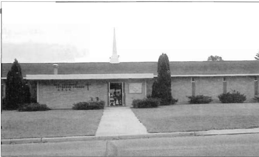
Our Saviour's Lutheran Church Zumbrota, Minnesota.