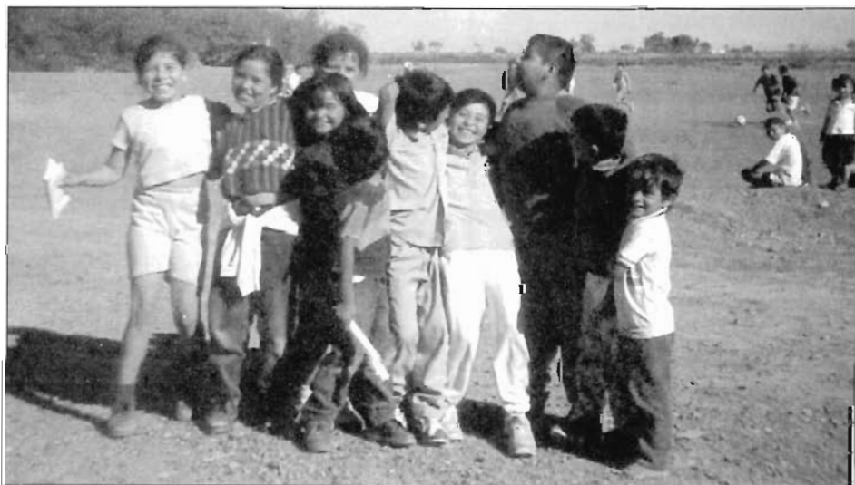
Some of the children in Agraristas, Mexico.