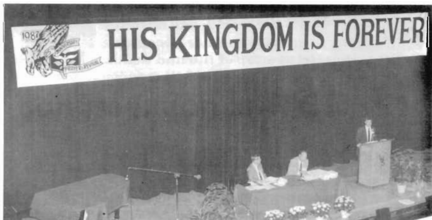
The 25th Annual Conference of the AFLC was held in Thief River Falls, Minnesota, in June of 1987.