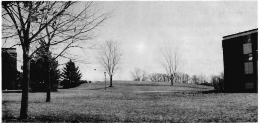
The possible site of the new student center is between the present dorms.