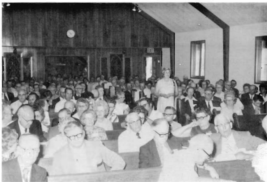
The 1974 Annual Conference at Our Saviour's Lutheran Church.