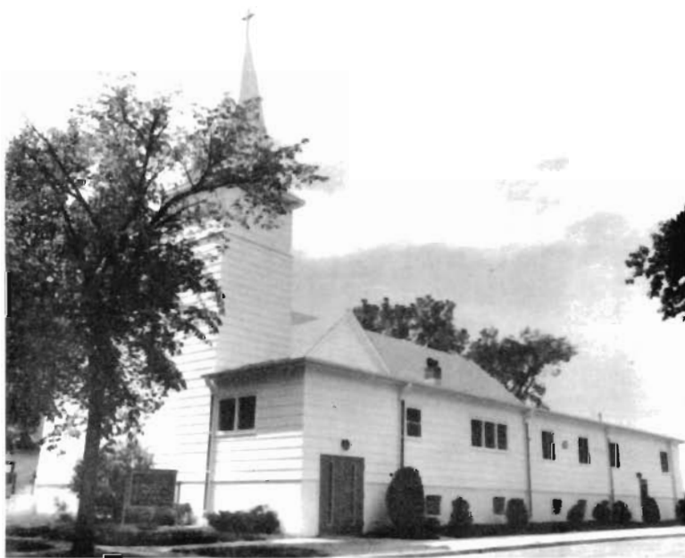
Our Saviour's Lutheran Church, Thief River Falls, Minnesota.

Where the Spirit of the Lord is there is liberty.