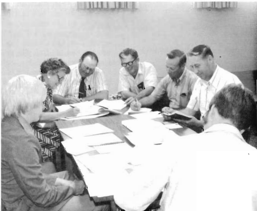
A 1976 AFLC Annual Conference resolutions committee. The delegates met at Suomi College in Hancock, Michigan. Conferences have been held as far south as DeKalb, Illinois, and as far northwest as Ferndale, Washington.

Eastern North Dakota W. North Dakota/E. Montana South Dakota NW Minnesota N. Central Minnesota SW Central Minnesota Nebraska/Kansas/Colorado Lake Superior Minneapolis Central Tri-State Northern Michigan South Central Southwestern West Coast Eastern Illinois