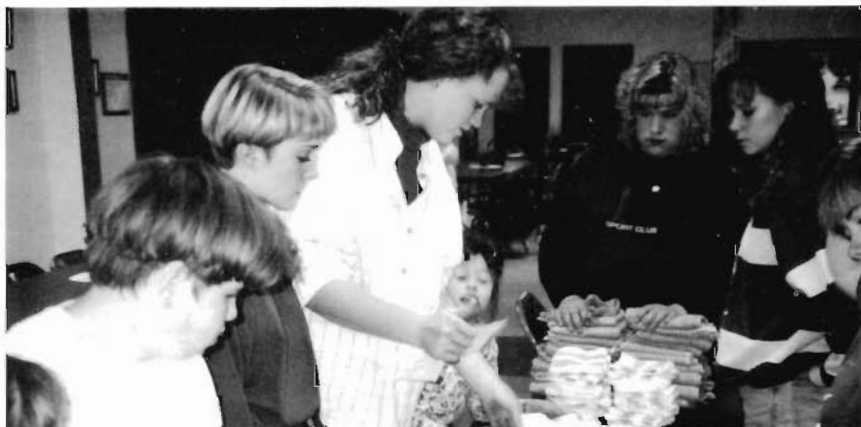
Our Saviour's youth packing the "Kits" for Brazil.

ber 1995, newsletter, they define missions as, "Any endeavor outside our local congregation to fulfill the Great Commission of Christ by proclaiming the gospel of Christ, making disciples, and relating to the total needs of mankind, spiritual and physical. The effort is divided between: 1) world missions — targeting cross cultural missionaries and ministries outside the metro area; 2) local missions — ministries and Christian workers within the