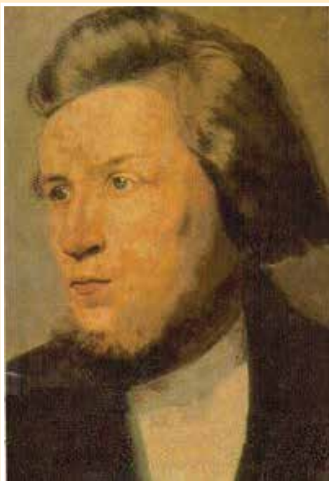
Hans Nielsen Hauge (1771-1824)