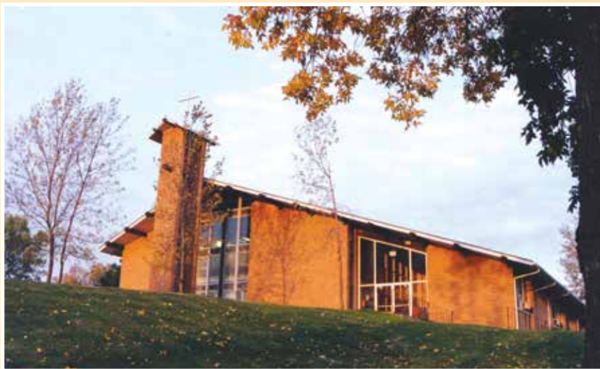
Free Lutheran Schools Chapel, Plymouth, MN