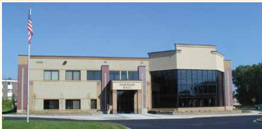
Heritage Hall, Plymouth, MN