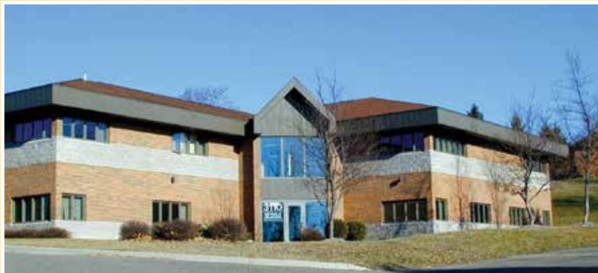
AFLC Administration Building, Plymouth, MN