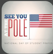
See You At the Pole

Click on each App to see more information