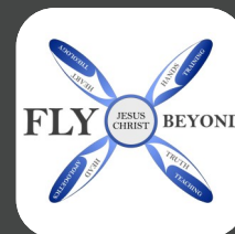
FLY Beyond Highlights