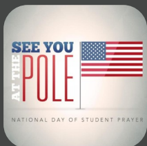
See You At the Pole