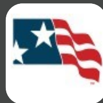
National Day of Prayer