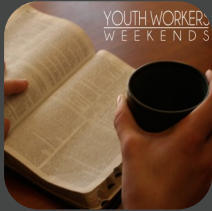
Youth Workers Weekends