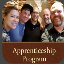
Apprenticeship Program Youth Ministry Apprentices