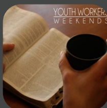
Youth Workers Weekends