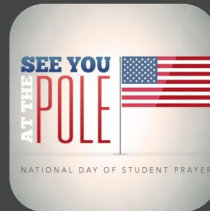
See You At The Pole