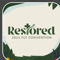
FLY 2021 "Restored"