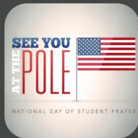
See You At the Pole

Click on each App to see more information