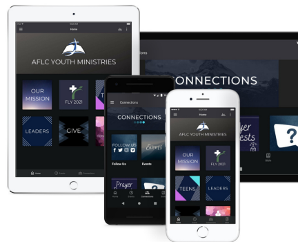
AFLC Youth App