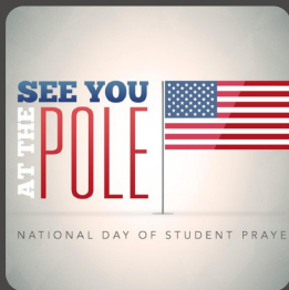
See You At The Pole