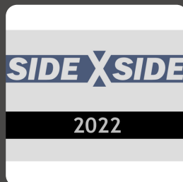
Side X Side