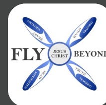
FLY Beyond 2018

AFLC Youth Ministries: A Treasury of Opportunities