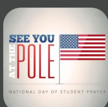
See You At The Pole