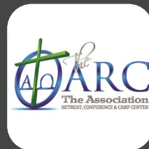
ARC Winter Retreats