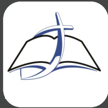
AFLC Youth Ministries

Click on each App to see more information