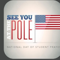
See You At The Pole