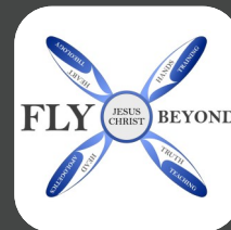
FLY Beyond 2018